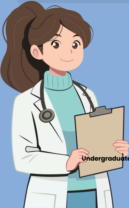
Clinical Placement Updates Apr- June